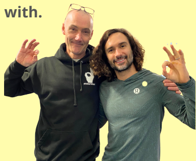
Photo: A chance encounter with T.V. star Joe Wicks, who took an interest in our mental health work in schools.

An important role our Youth Worker and volunteers have is giving young people a listening ear and encouraging them to talk. Here are some examples of the work we are involved with.