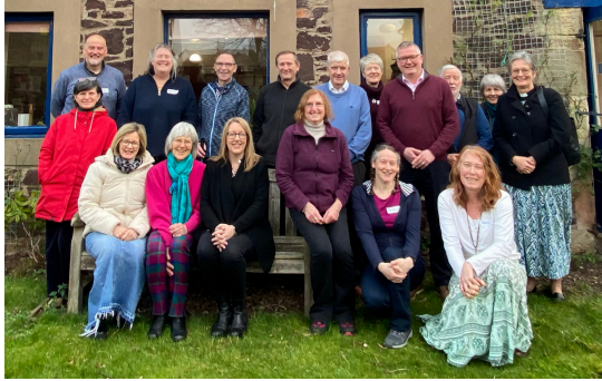
In the picture: Folk from different churches gather to seek vision for the future of DACYP