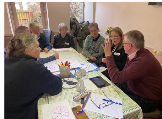
Lots of ideas to consider such as raising young leaders, a second worker and developing children and families provision